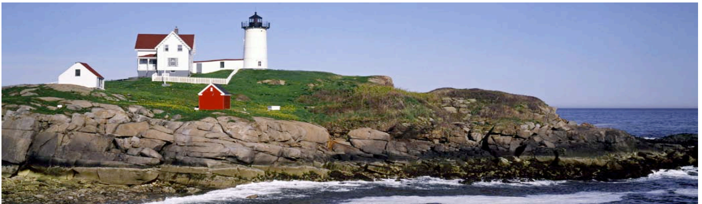
Sendero Lighthouse, York Maine